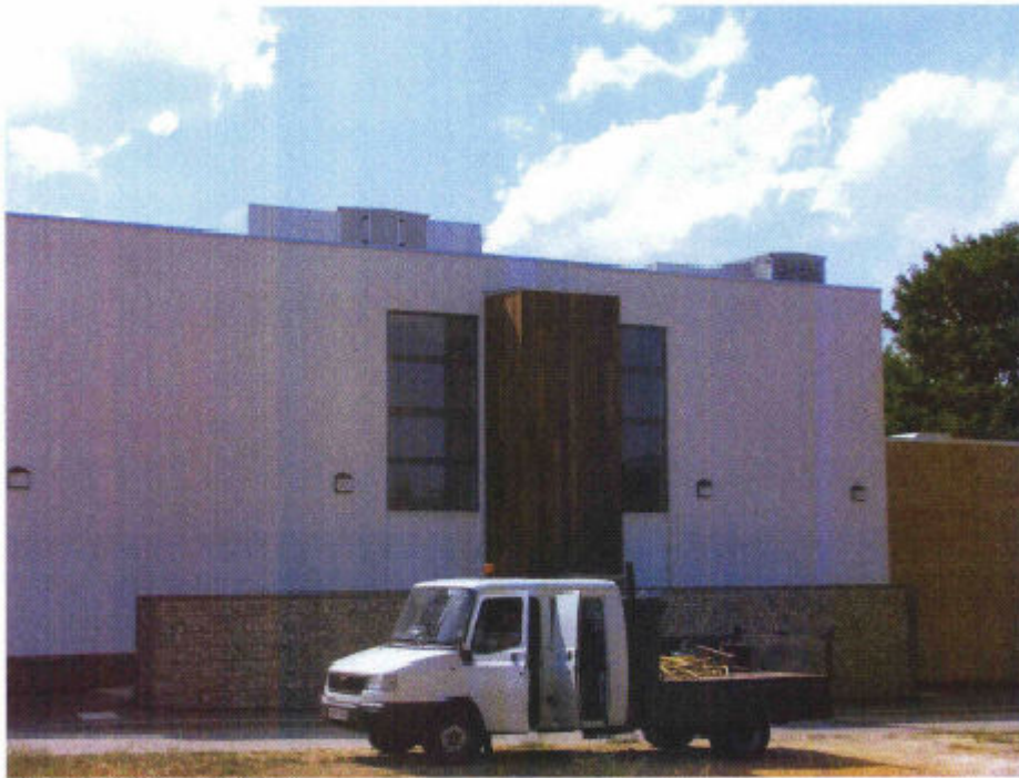
VIEW FROM EAST