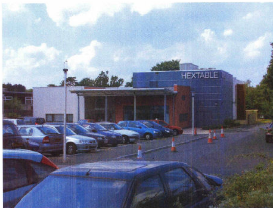
VIEW FROM SOUTH-EAST LOOKING TOWARDS MAIN ENTRANCE

HEXTABLE DANCE SCHOOL VIEWS SHOWING ROOF-TOP PLANT INSTALLATION