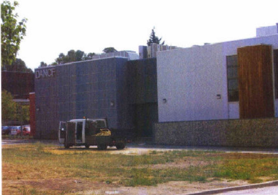
VIEW FROM NORTH